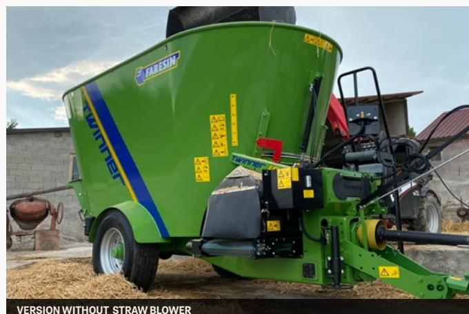
VERSION WITHOUT STRAW BLOWER