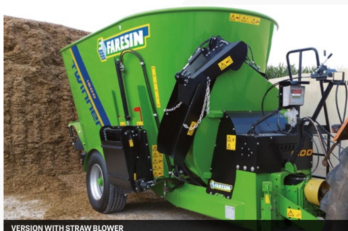
VERSION WITH STRAW BLOWER